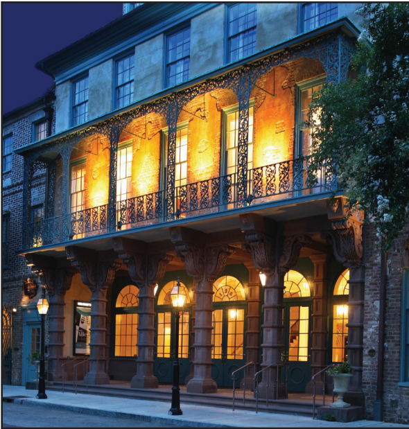
Dock Street Theatre • 135 Church Street

Please make sure the following information and bus parking map is given to your bus company before your scheduled performance.